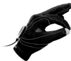
Alternative access options