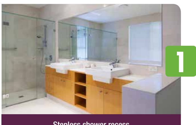
Stepless shower recess