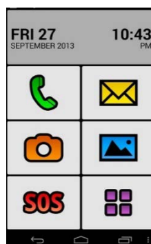
Simplified displays on mobile phone