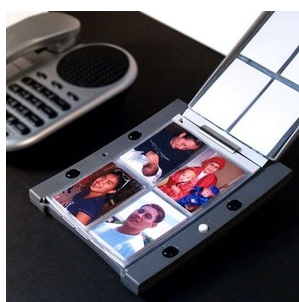
Telephone with photos

Use the National Equipment Database at www.ilcaustralia.org.au for further information on communication devices for low vision