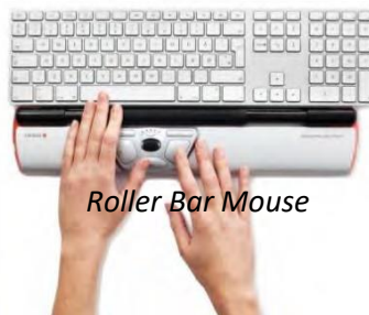
Roller Bar Mouse