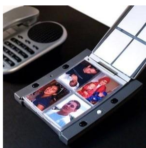
Telephone with photos

www.ilcaustralia.org.au for further information on communication devices for low vision