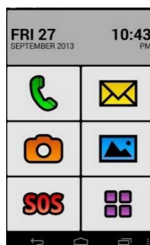
Simplified displays on mobile phone