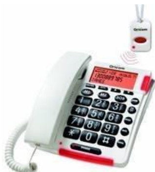
Telephone with big buttons