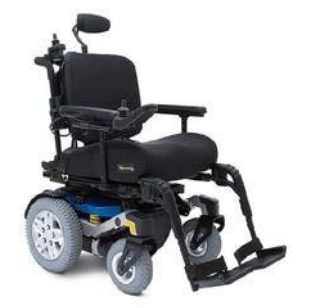
Rear wheel drive