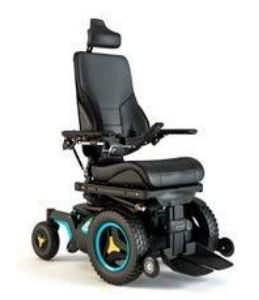
Front wheel drive

Some PowerDrive wheelchairs have four-wheel drive or caterpillar-style wheel options. They may also have large-diameter knobby tyres. These are designed to be used over rough, uneven surfaces but are not recommended for smaller spaces.